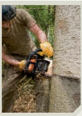
A tissue – all cut down

We are in the process of running a similar study using true third-person doppelgängers; the results await completion of analysis. In follow-up studies we are extending this work to and to other environmental domains, for example water use and carbon dioxide production.