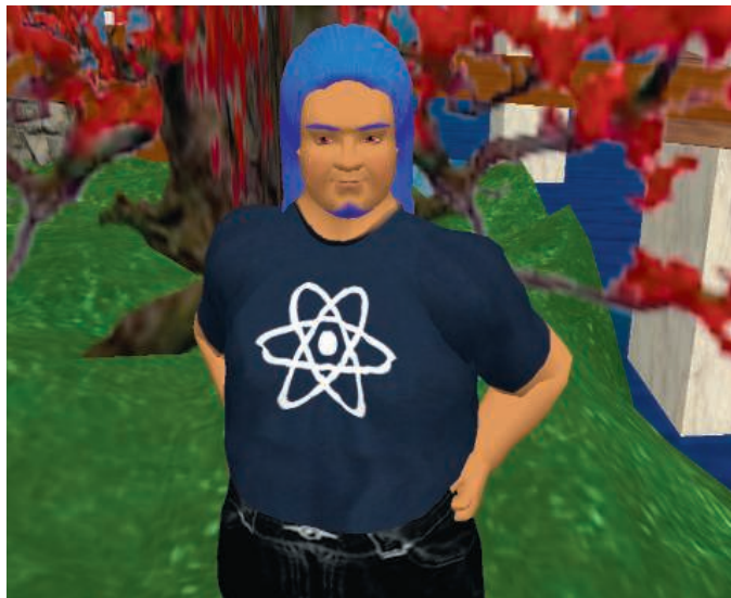
Instant makeover. The malleability of avatars adds a new dimension to social interactions in virtual environments.