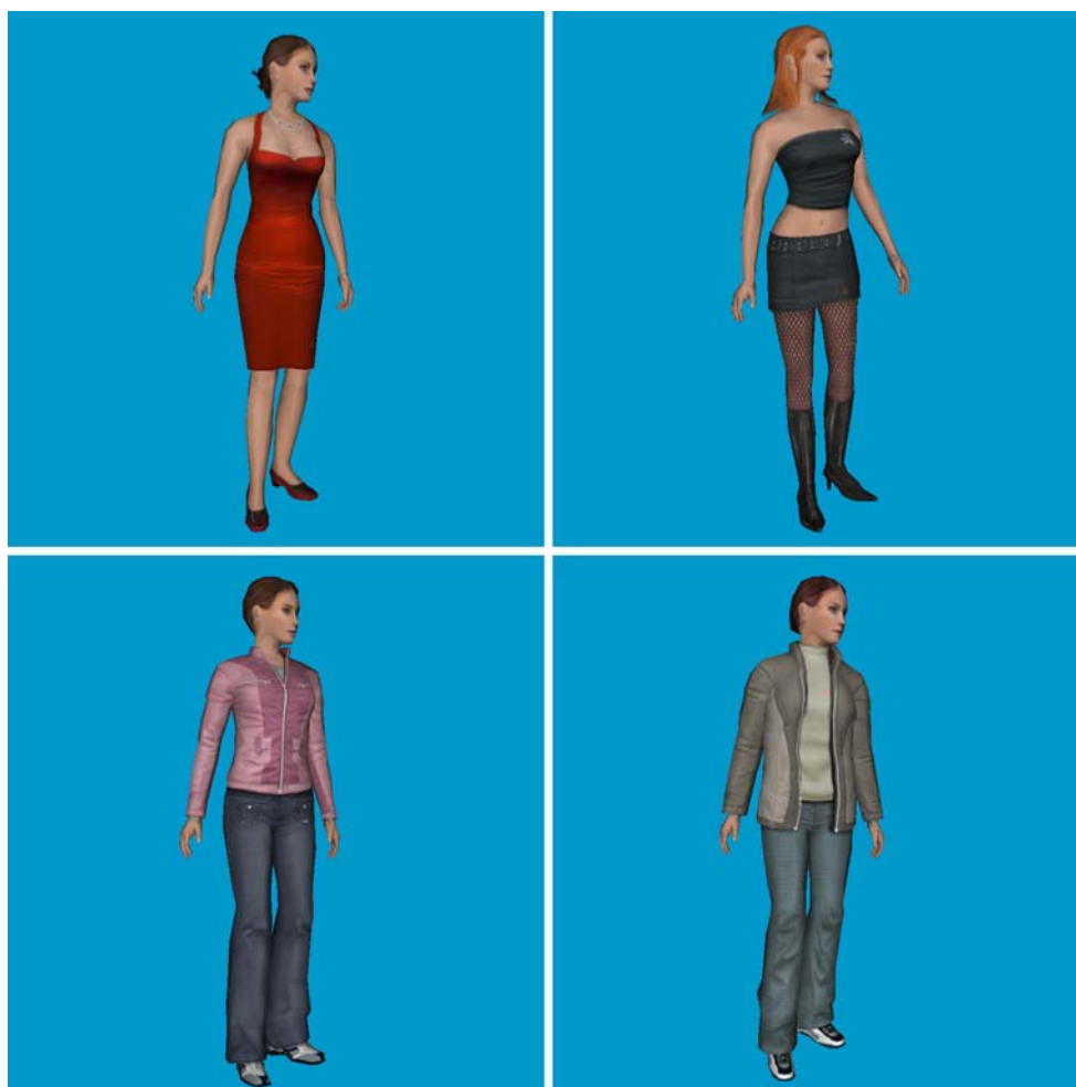
Fig. 2 The female agents used as stimuli. Top row: Suggestively dressed agents; bottom row: Conservatively dressed agents.

although the agent demonstrated the same quantity and type of movements as in the high gaze condition (turning the head, shifting weight), they were not contingent on the participant's movement and so the agent did not appear responsive. For example, in the high gaze condition, the agent would turn her head as the participant approached and appeared to make eye contact. In the low gaze condition, it would not matter that the participant was approaching; the agent would turn her head in accordance to the playback rather than the participant's movement. As a result, the agent's movements in the low gaze condition seemed random, and she would only occasionally appear to look at the participant.