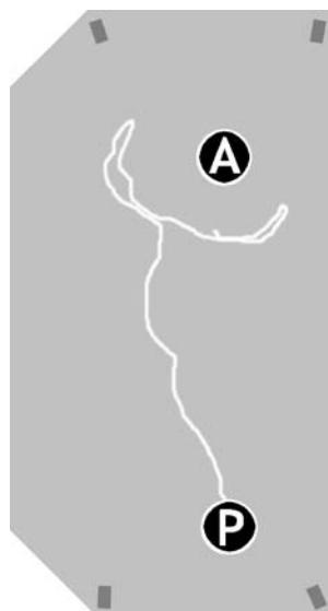
Fig. 3 A bird’s eye diagram of the experimental setup. Cameras at the corners of the room track the participant’s (P) walking path as s/he approaches the agent (A).

To assess if the sexualized dress manipulation was successful, participants were asked to indicate on a 5-point scale (1=Not at all; 5=Extremely) how sexy and how suggestively dressed the agent was. To assess the gaze manipulation, participants were also asked to indicate their agreement on a 5-point scale (1=Strongly disagree; 5=Strongly agree) with the following statements: “The agent seemed to see me” and “The agent appeared to acknowledge my presence.” In keeping with the cover story that participants were immersed in order to evaluate the agent, several filler items regarding the agent’s appearance and responsiveness were also included.