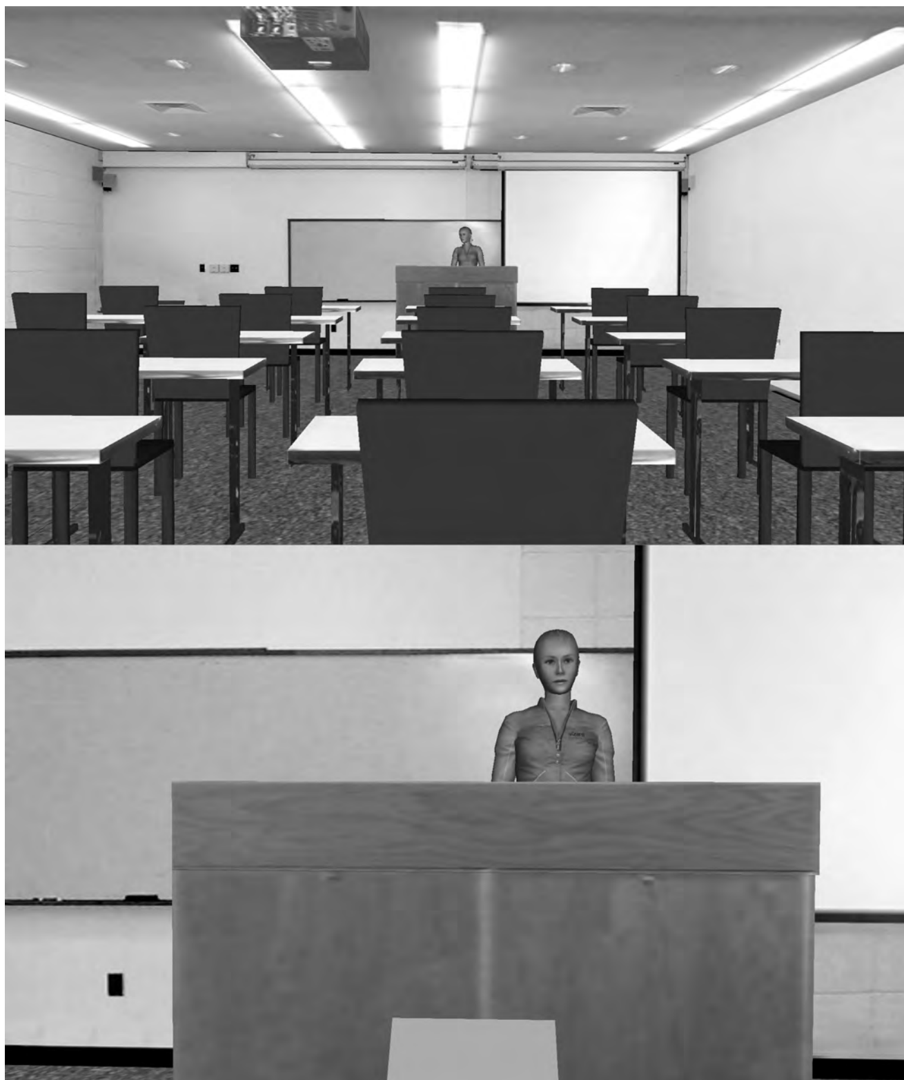
Figure 2. Views from the back (top) and front (bottom) seats within the virtual classroom.