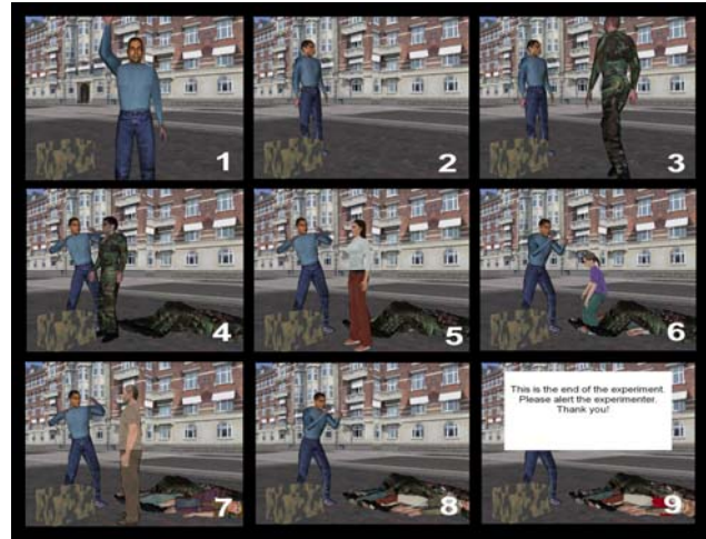
Figure 1. Simulation of the immoral behavior. In the first scene the virtual human stands directly in front of the subject's view and waves. This scene allows the subject an opportunity to examine the virtual human's face in detail (1).

stimulus was designed to grow more intense and immoral over time; therefore, the virtual human punched 20 male soldiers first, then a mix of 20 women and children, and finally a mix of 20 children and elderly individuals. The virtual simulation lasted approximately five minutes (see Figure 1).