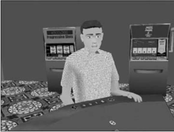
Figure 3. The Witness's View of the Suspect During the Alleged Cheating.

with his right hand, and the woman testifies that she witnessed this behavior. Because it is possible to render an IVE from any orientation in the room, it is possible to demonstrate whether the woman had the vantage-point to witness the man cheating. As Figure 3 demonstrates, given their seating arrangements, the suspect's right hand was not visible to her.