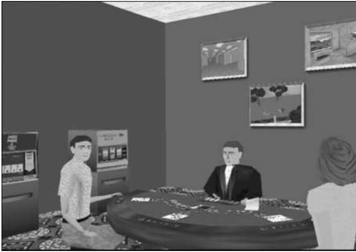
Figure 2. An IVE Recreation of a Crime Scene at a Casino.

tools with a survey of the psychological literature concerning their use. The current work attempts to provide this much-needed discussion. We begin by discussing how the re-creation of crime and accident scenes can benefit from the use of virtual technology.