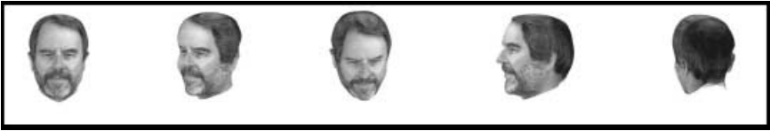
Figure 5. Five Viewpoints of a Three-Dimensional Digital Bust.

Graphics software can produce digital busts, three-dimensional reproductions of human faces that are quite accurate. Figure 5 shows an example of an individual whose head has been reconstructed using this technique. Research by the authors of this article (Bailenson et al. 2004, Bailenson, Beall, & Blascovich 2003) demonstrates that, in a series of studies, people are quite good at learning and recognizing these digital busts. In those studies, experimental participants were trained to learn alleged suspects by either watching videotapes or by studying photographs. Then, the same participants had to identify those suspects by examining additional photographs of the suspects or by examining images of the virtual busts of the suspects. The results of over a dozen studies using over three hundred experimental participants indicate that, given current technology, people are slightly better at recognizing photographs of faces than still-images of the digital busts. However, as this developing technology for crafting the three-dimensional heads improves, this difference should diminish. It is important to point out that, just as photographs are not perfect representations of live human faces, neither are digital busts. However, because it is possible to capture three-dimensional information concerning depth, as well as being able to portray faces from variable angles and distances, in the near future digital busts should easily outperform two-dimensional photographs.