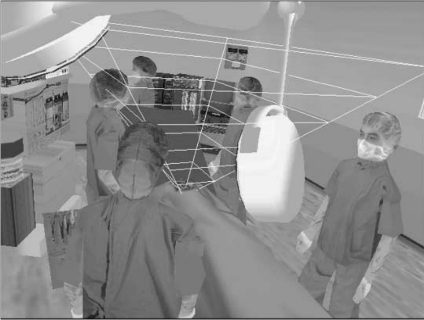
Figure 4. A Simulation Demonstrating Witness Viewing Abilities with a View Frustum Created for the Federal Judicial Center and Utilized in Courtroom 21 at William and Mary.

bringing a juror into an IVE, the lawyer can give the juror her client's perspective view of the scene and the juror can manipulate and "play" with the digital assets to test the credibility of that perspective. Lawyers can use these recreations to establish the emotional state of the defendant (i.e., was an assault actually a case of self-defense?), the witness (i.e., would the average person be able to remember a given number of details under stress?), or the victim (what type of emotional distress did the victim suffer?).